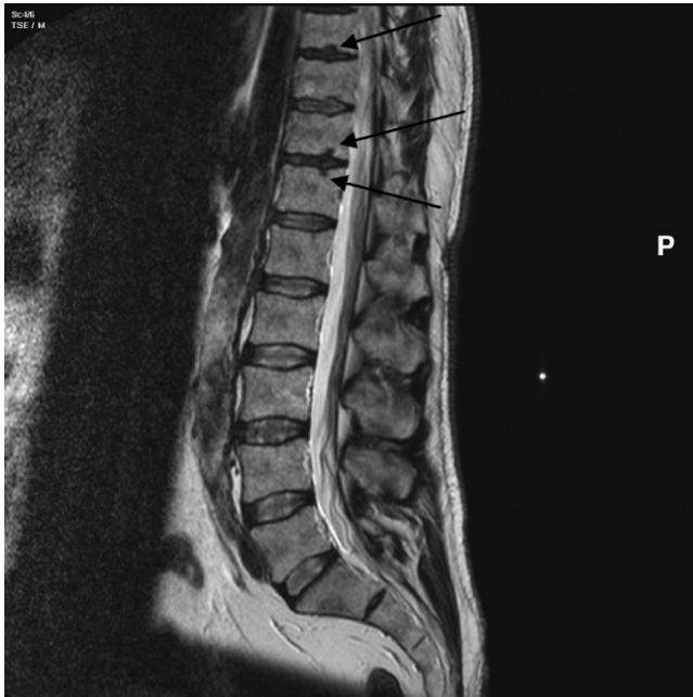
Figure 1. T2-weighted magnetic resonance imaging scan of the lower thoracic and lumbar spine showing Schmorl's nodes (SN) and degenerative change. SN are evident at T9 caudal, T11 caudal, and T12 cranial surfaces (arrows). Thoracic intervertebral discs also display degenerative change with decreased signal intensity and loss of disc height (image courtesy of Dr. Nisha Manek, Mayo Clinic).

population of healthy adult female twins using MRI of the thoracolumbar spine. Disc material is clearly indicated on MRI and this imaging modality is generally considered the most sensitive technique for examining disc degeneration (15). Using the classic twin design, the extent to which genetic and environmental factors accounted for the occurrence of SN was estimated.