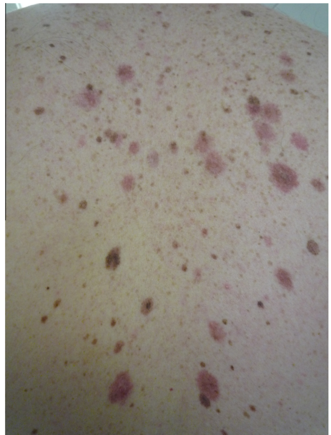
Fig. 1. The atypical mole syndrome (AMS). Naevi genetics has helped in discovering new melanoma genes but this phenotype is also helpful as it does unravel some associations between melanoma risk factors and other phenotypes such as reduced ageing and longer telomeres.

The number and types of naevi (such as atypical naevi) is the strongest risk factor for melanoma in all Caucasian populations and the magnitude of the odds ratios (5–20) is much greater than any odds ratios ever reported for sun exposure and skin colour (1.5–2) (Fig. 1) [12,13]. Naevi confer the same magnitude of risk for melanoma at all latitudes showing again that sunlight is not that important for this association [14]. Looking into the biology of naevi is likely to lead to very interesting clues regarding the pathogenesis of melanoma. Melanocytes derive from the neural crest cells and their differentiation and migration to the skin occur during embryogenesis. This involves many genes such as MITF, WNT signalling, SOX10 and SOX 9 to mention only a few [15]. Interestingly, one of these genes, MITF has recently been reported to be involved later on in adulthood in melanoma susceptibility and invasion [16,17]. BRAF somatic mutations are also very common in naevi and melanoma and this led recently to the first therapy ever conferring an increased survival in melanoma [18,19]. Bastian and colleagues have looked at genetic signatures in melanoma tumours according to histological subtypes and body sites [20]. BRAF mutated melanomas are more common on the trunk and limbs compared to head and neck tumours and this again was thought to be due to differences in sun exposure but this